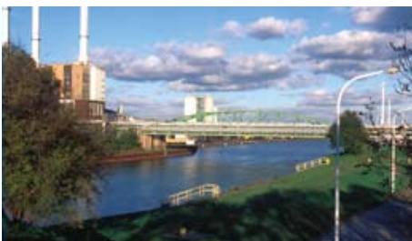
Location Chemical Industry Park Marl / Germany

This automatic reporting supports the performance of routine tasks for the technical personnel in central energy control stations and keeps management informed of current operation at all times.